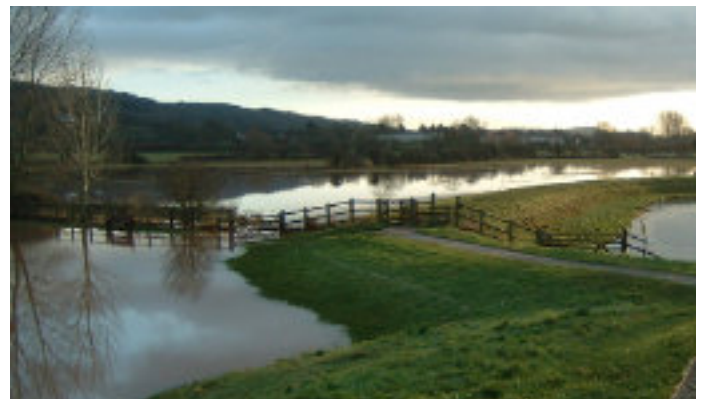
2008 Millennium Green Towards the tree line, the water is approaching 2 metres deep.