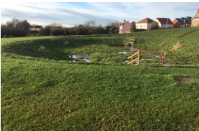
Who knows maybe the site of a future outside broadcast of 'Desert Island Discs'!