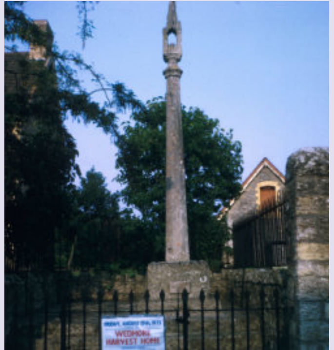
The first photograph I consciously regarded as an archaeological record: Wedmore village cross, August 1973