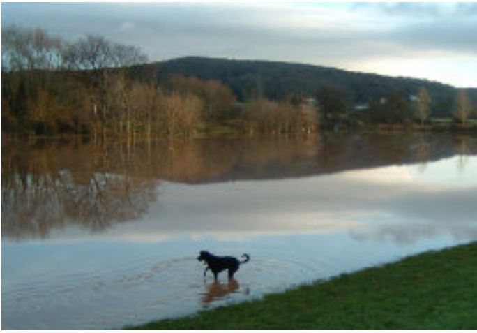
2008 Millennium Green Towards the tree line, the water is approaching 2 metres deep.