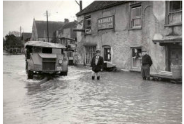
1950 High Street. Note there was a step down to the shop floor so any flooding would have extra depth