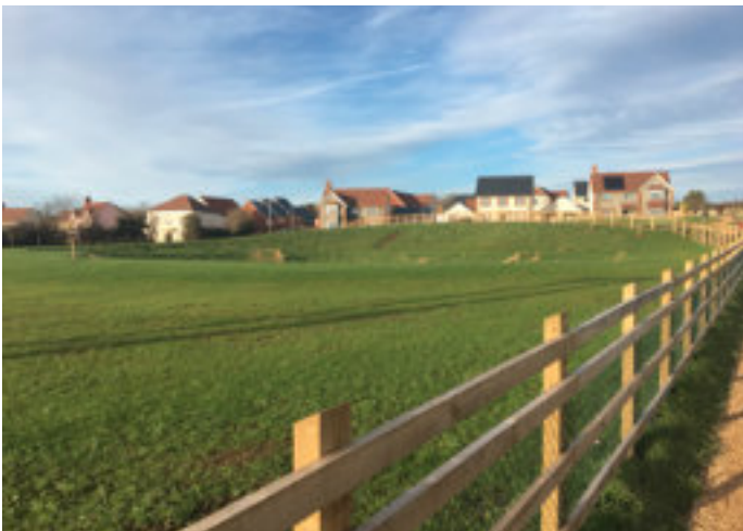
It is however heartening to see that in the latest housing development in Congresbury (Cobthorn/Furnace Way) that attention has been paid to flood alleviation as shown in these pictures of the flood lagoon.