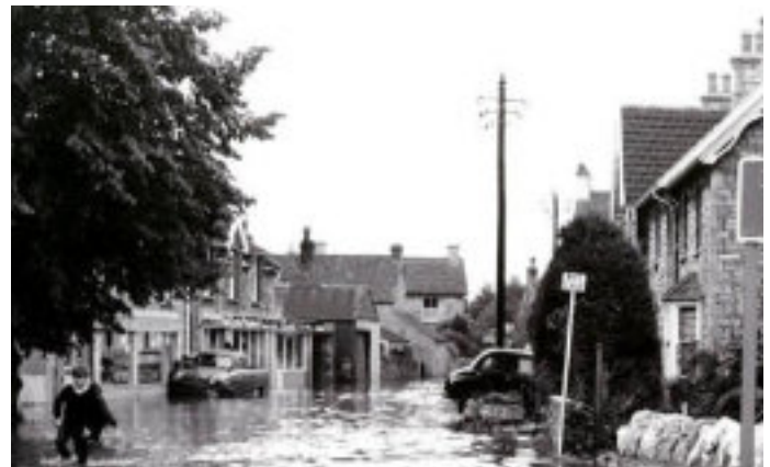
1968 Broad Street