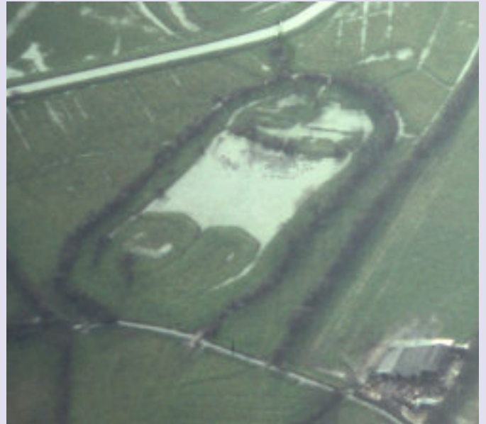
An air photograph of the decoy pool in Hythe Lane, March 1982, before infilling by the farmer later that year.