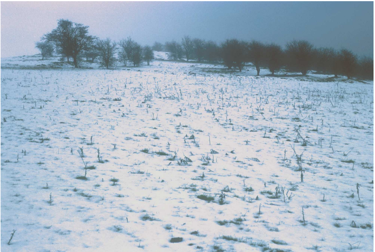
Winter at Buggo's enclosure 1984