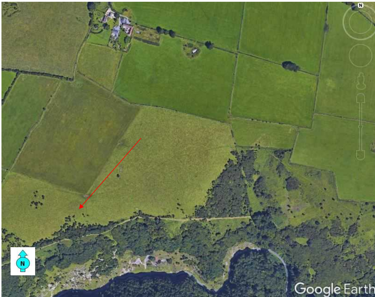
Fig 1: Location of Buggo's enclosure

The enclosure lies at ST47535480 on the north side of Cheddar Gorge, and 600m south of the former Piney Sleight Farm. It lies on land sloping gently down to the top of the cliffs of the Gorge.