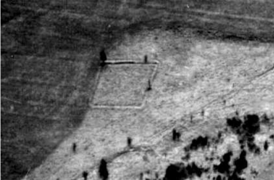
Fig 2: The enclosure recorded on the 1946 air photographs

The first known record of this site is the RAF air photographs of c1946 (below).