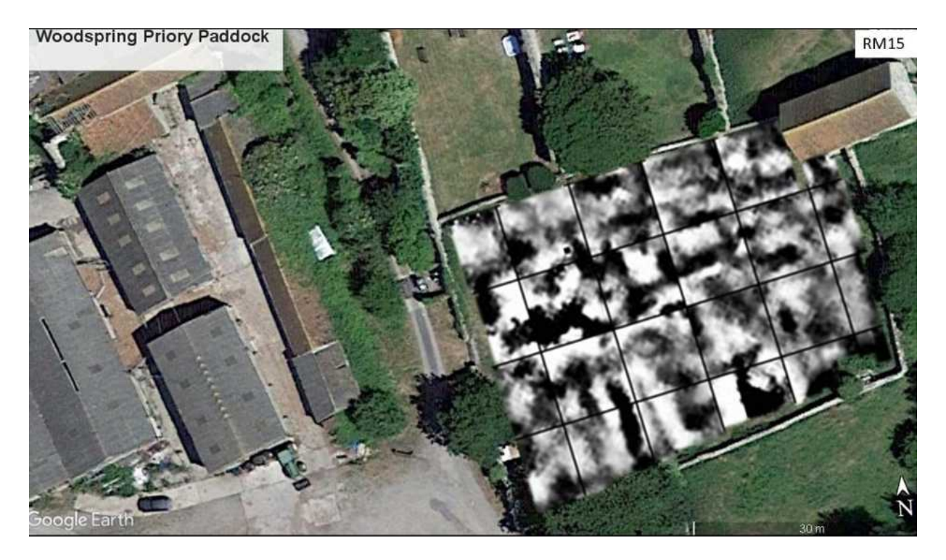
Fig 4: Results of 2020 0.5m x 0.5m surveyed

This uncovered a plethora of structures and responses within the paddock. Since the walls around the paddock clearly overlie structures seen in the resistivity survey, it was next intended to extend the 0.5m \times 0.5m to the south, and the grids were surveyed in, but it was at this point that the virus outbreak began. It seems premature to begin interpreting the structures without further work, but some clearly coincide with features seen in crop marks in 2013 (Fig 5).