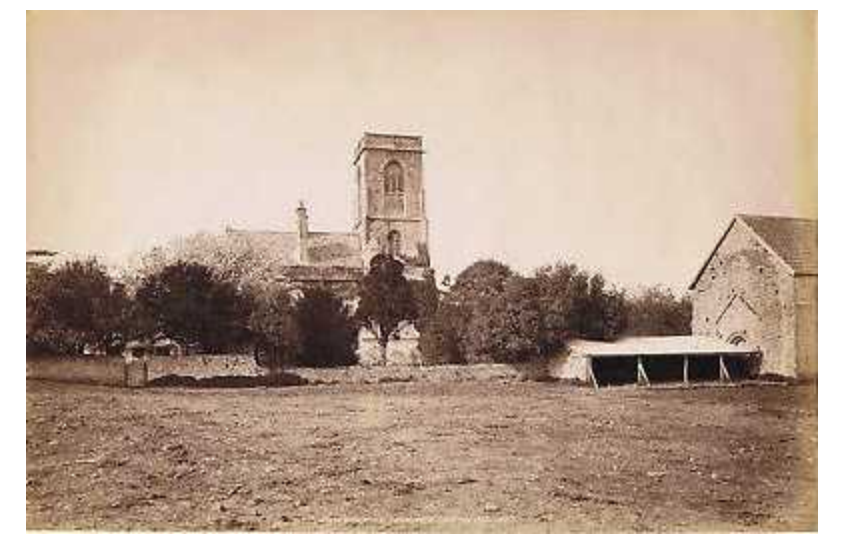
Fig 6: Post card of c1910

Finally, various members of YCCCART have collected numerous historic postcards of the Priory. One of the paddock is very significant (Fig 6 below)