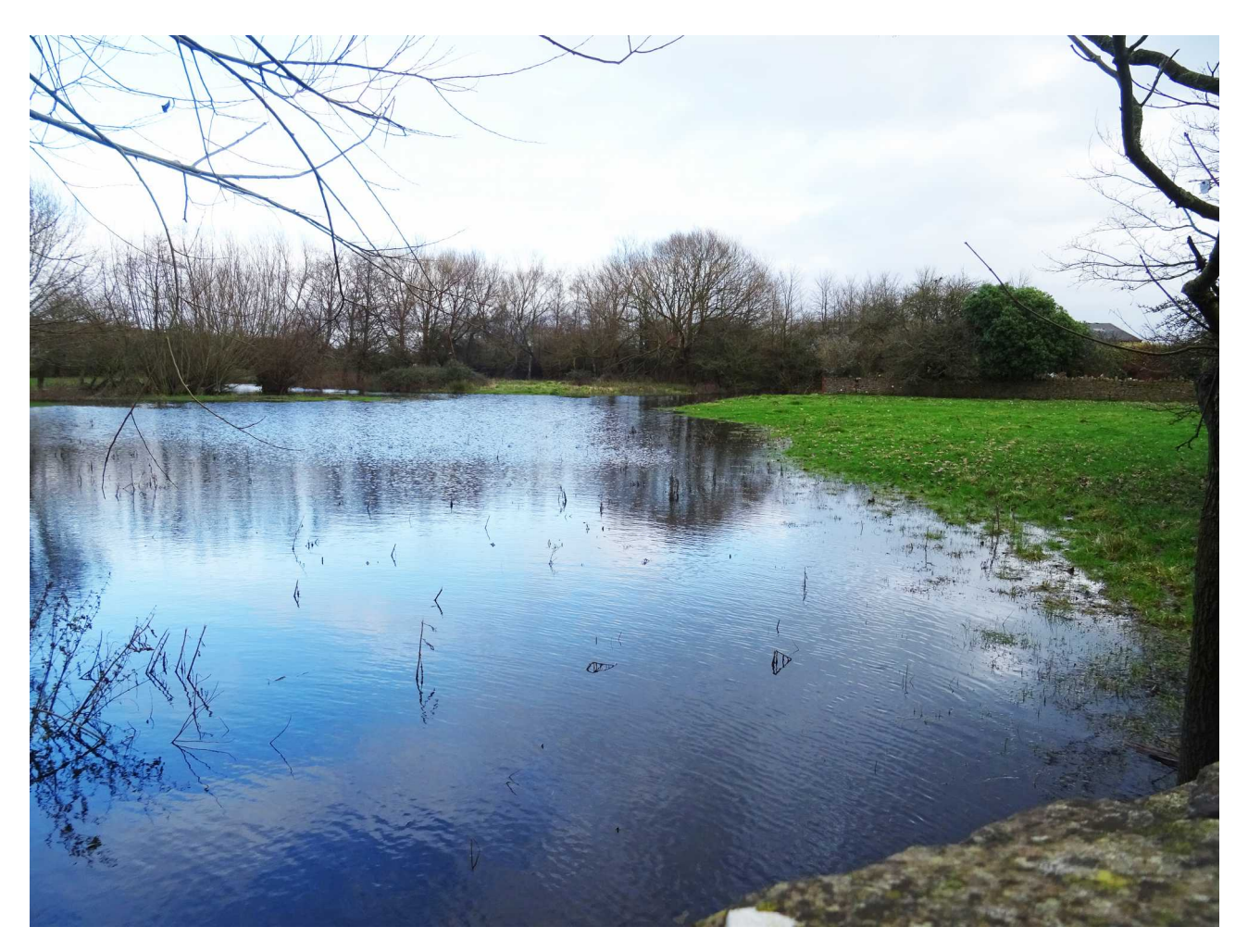
Fig 0: Area 5 of proposed survey, Jan 6th 2020