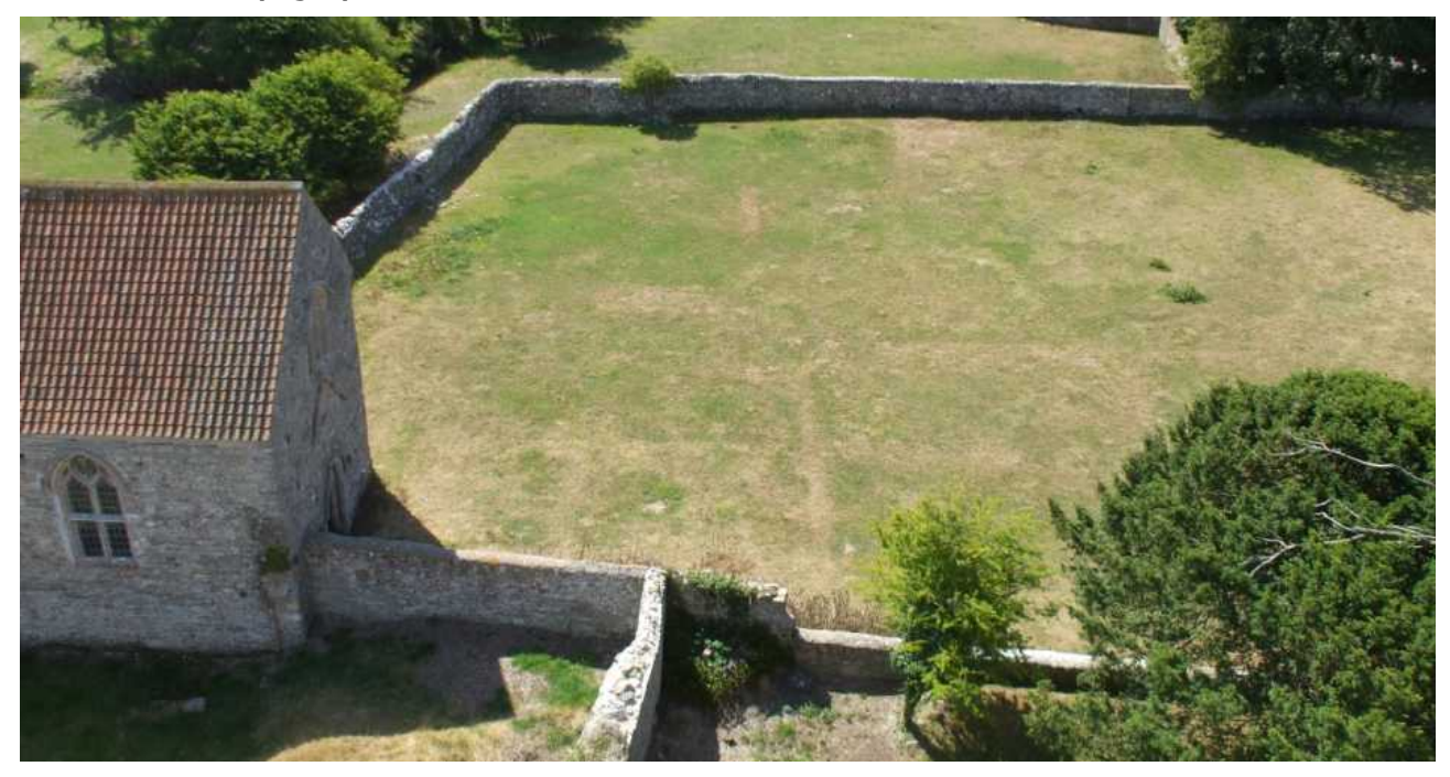
Fig 5: Crop marks in the paddock from tower, 2013

This uncovered a plethora of structures and responses within the paddock. Since the walls around the paddock clearly overlie structures seen in the resistivity survey, it was next intended to extend the 0.5m \times 0.5m to the south, and the grids were surveyed in, but it was at this point that the virus outbreak began. It seems premature to begin interpreting the structures without further work, but some clearly coincide with features seen in crop marks in 2013 (Fig 5).