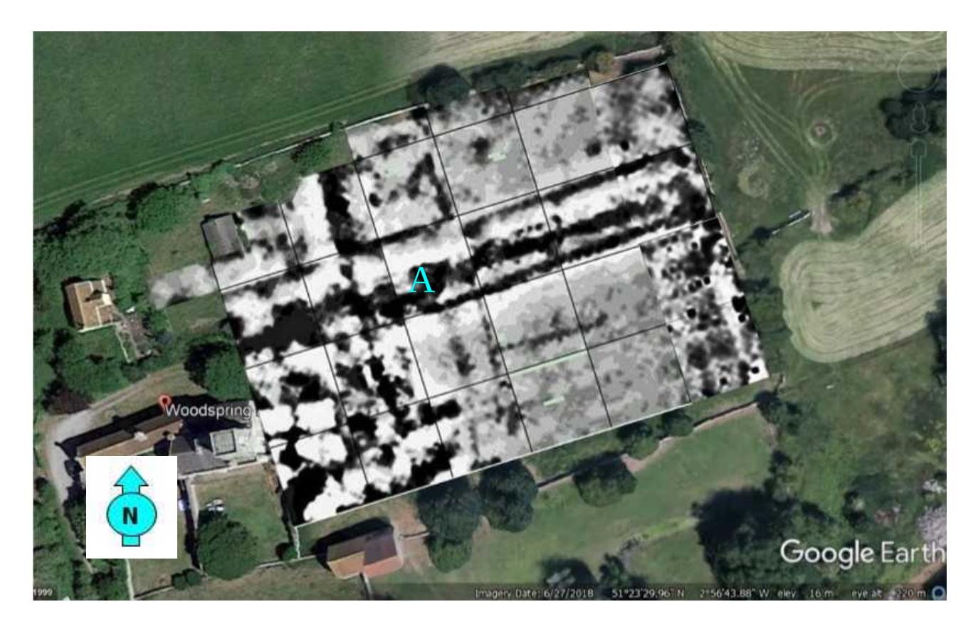
Fig 2: Completion of orchard survey (Area 1)

Although differing slightly due to soil conditions (2012: high summer; 2019: autumn), it is instructive to see how the clay drainage pipes and their backfill appeared as high resistance in summer, but low in autumn.