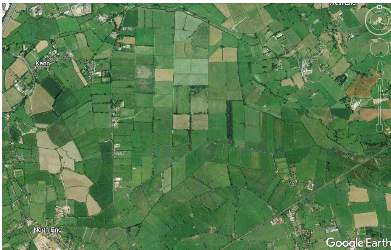
Fig 1: Location

Kenn Moor, a formerly open Common, is centred on ST433684, some 2.5km SE of Clevedon, and 3.5km SW of Nailsea, in the parishes of Yatton and Kenn, in North Somerset. It consists of 4.3 km 2 of land, largely flat and supporting fields and roads of geometrical pattern.