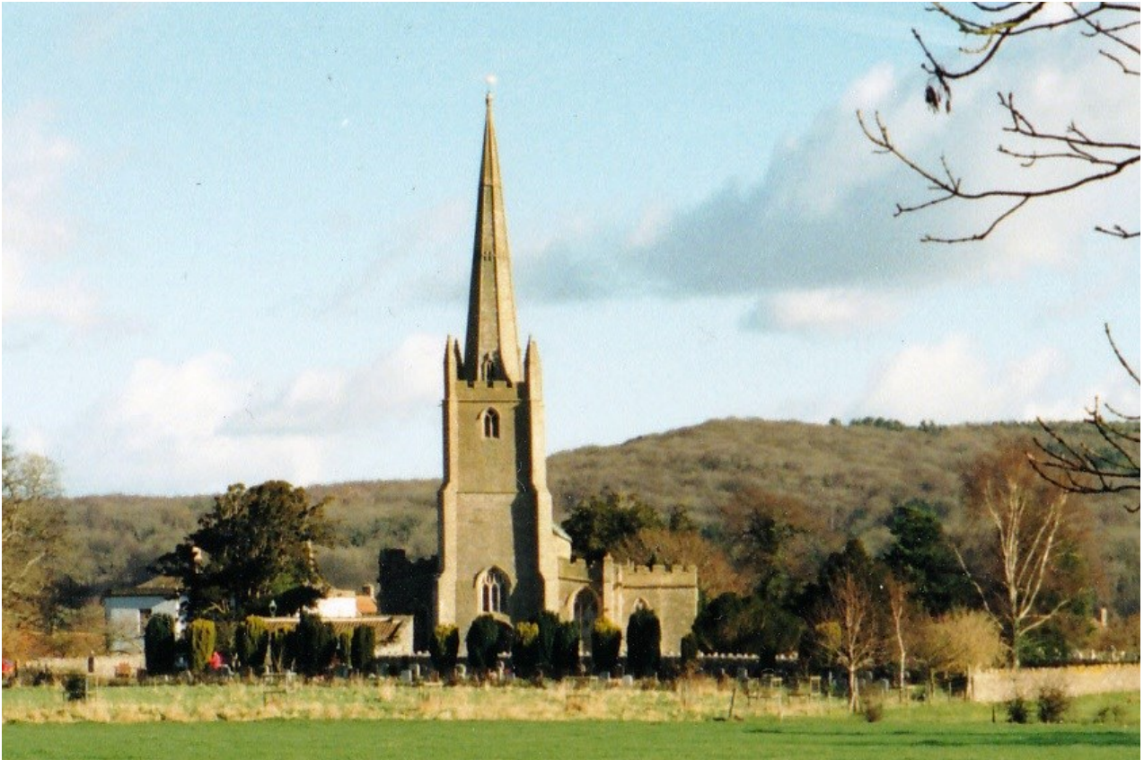
Congresbury church.

This publication is an attempt to provide a detailed history and guide to St Andrew's church, the Refectory and surrounding grounds.